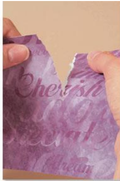
Pull the paper toward you for a colored edge.