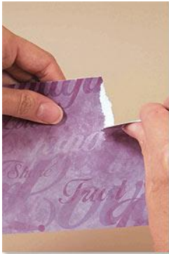
Pull the paper away from you for a white edge.